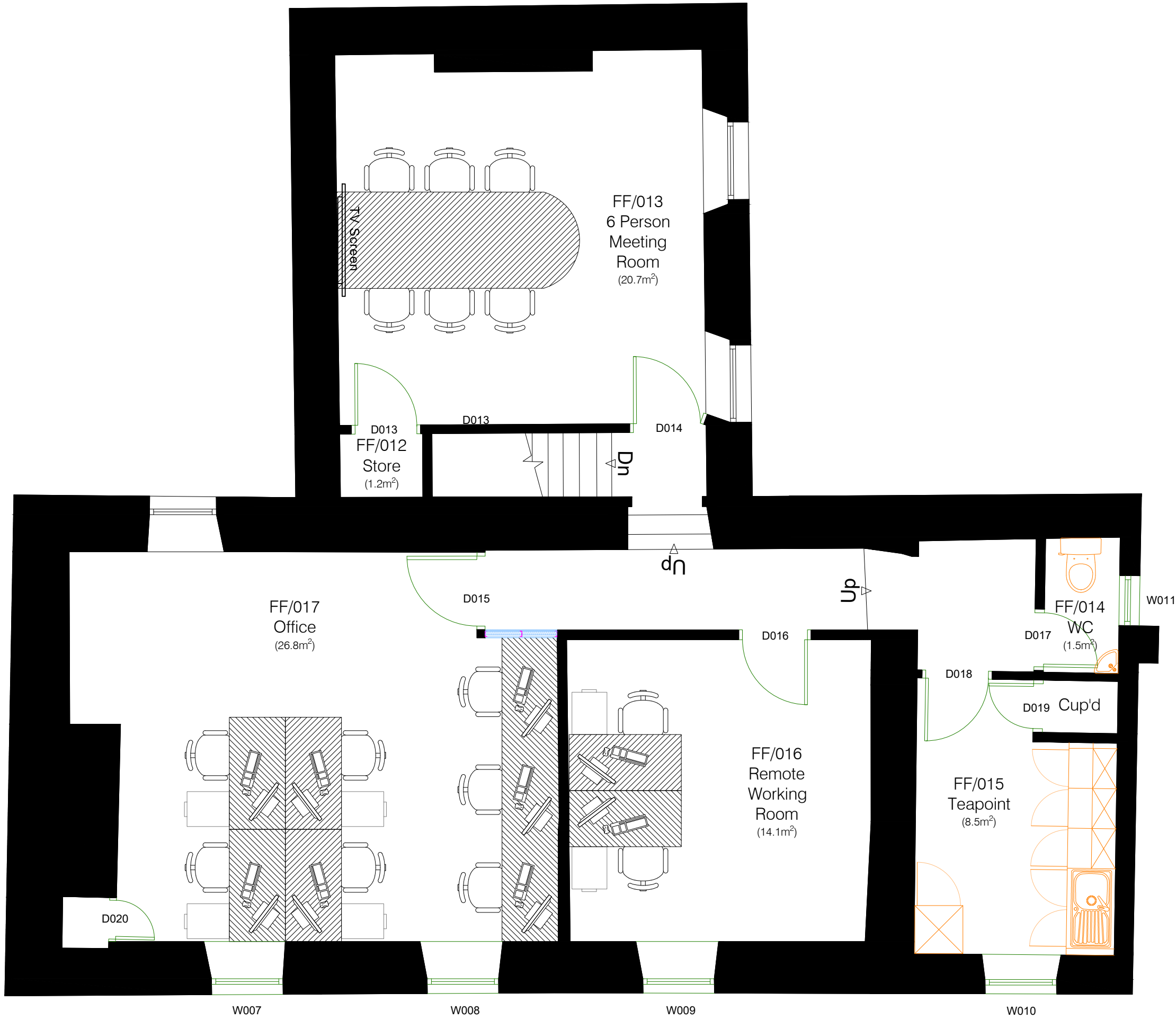
Proposed First Floor Plan - General Arrangements Scale 1:50